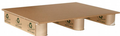
PALLET 1/2E 600 x 800 mm