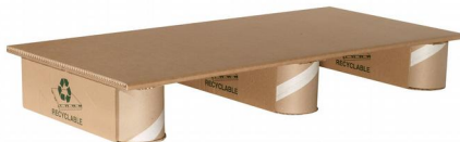
PALLET 1/3E 400 x 800 mm