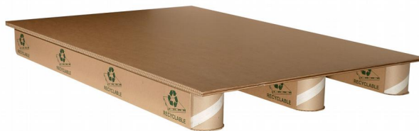
PALLET E 1200 x 800 mm