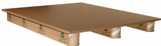
PALLET F 1200 x 1000 mm